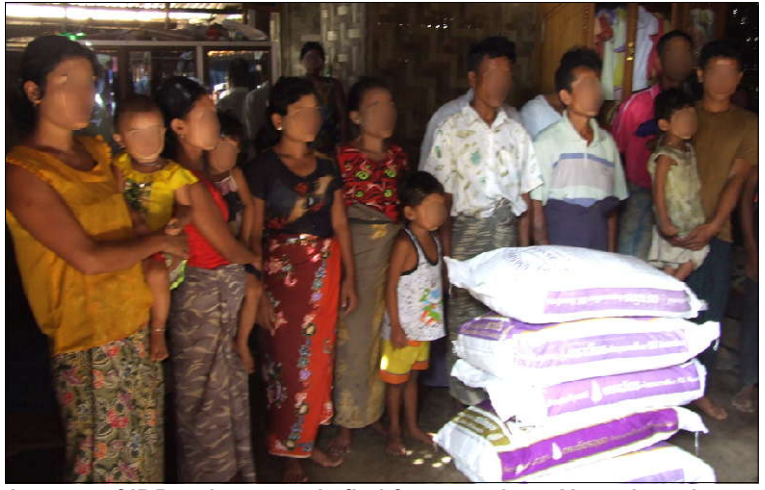
A group of IDPs who recently fled from southern Ye and northern Tavoy into Thailand

On October 11th, IB No. 61 arrested two residents of An-Din village, in western Ye Township. According to an NMSP source who recently traveled to An-Din, Captain Myint Zaw and 25 troops from IB No. 61 accused the two men of supporting the Chan Dein rebel group, interrogated and beat them until a 300,000 kyat ransom secured their released.