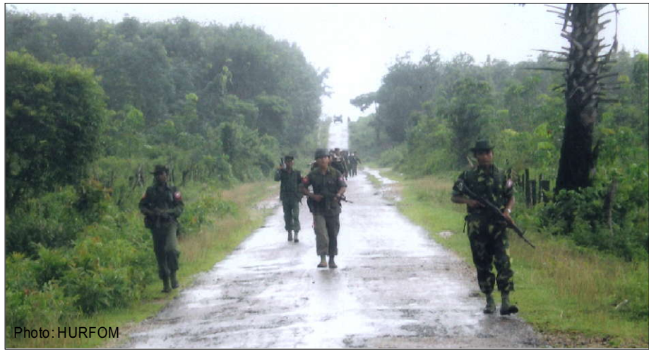
Burmese troops patrolling an area in southern Ye Township

Residents also reported the arrest, interrogation and violent beating of unarmed villagers. Ostensibly for information gatherings, local sources allege that at least some of these assaults were arbitrary