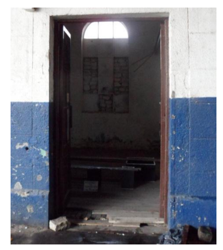
View of a room at Olimpo, similar to those used for torture. Notice how the window is bricked up enough to block the view from outside but open enough for sound to leave.

Argentina, were killed. Not wanting to use more typical methods of killing such as shooting, the military and police officials showed a sort of evil ingenuity. When prisoners had been condemned to die, they were sedated and taken on "death flights" to be dropped from helicopters into the sea. Most of the bodies were never found.